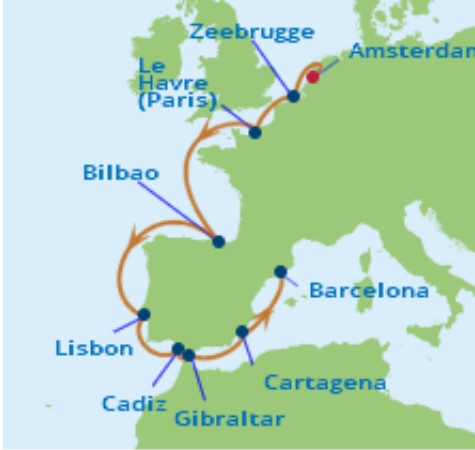
PORT OF DEPARTURE: ● PORT OF CALL: ● CRUISE ROUTE: —

Taxes, fees and port expenses: 140.93 USD